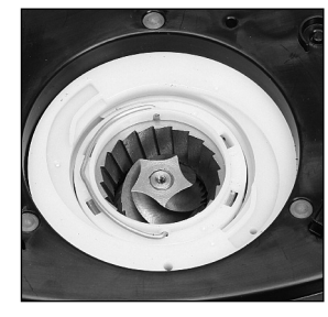
Fig. 7 Fig. 8 Fig. 9