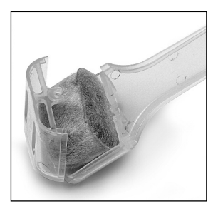
Fig. 10 Fig. 11 Fig. 12