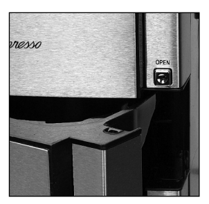
Fig. 4 Fig. 5 Fig. 6