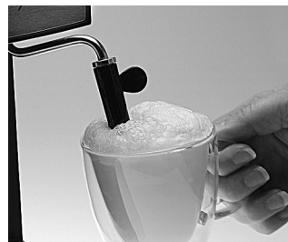
Steam Wand (remove Black Frothing Sleeve) for steaming only