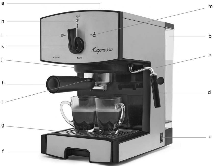
Fig. 1 Capresso EC50 User Components