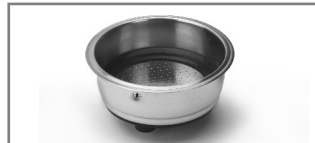
Dual function sieve (for 1 or 2 cups)