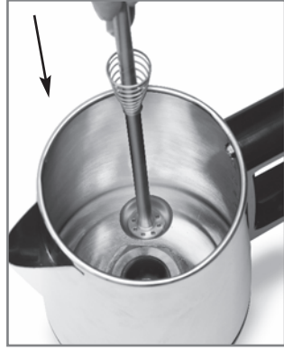
Inserting tube into heating well