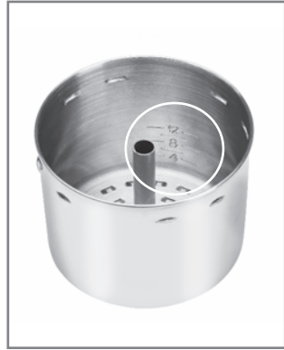
Cup markings inside basket