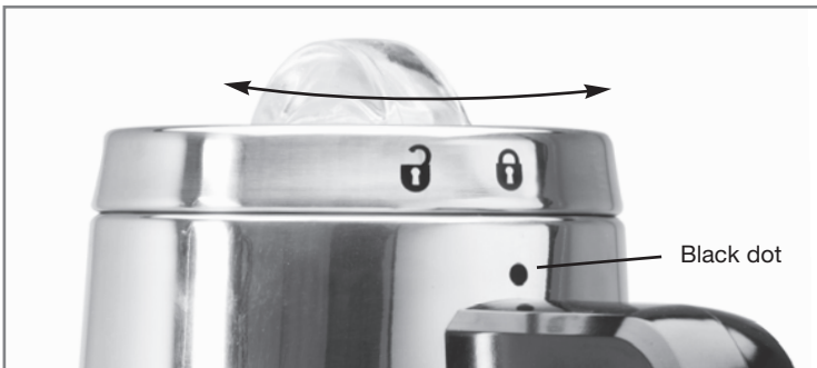
Turn to align symbol with black dot, to lock and unlock lid