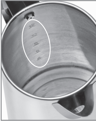
Cup markings inside body