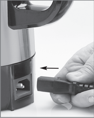
Connecting power cord to base